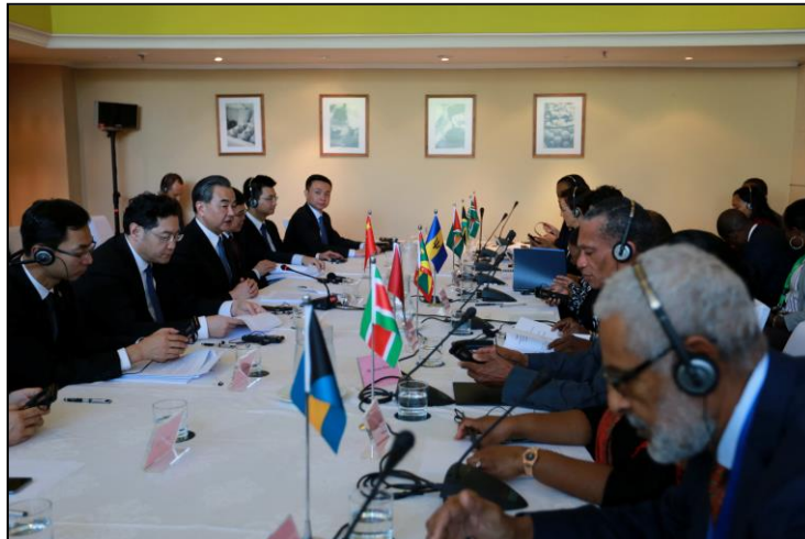
Senator the Honourable Dennis Moses, Minister of Foreign and CARICOM Affairs of the Republic of Trinidad and Tobago, His Excellency Wang Yi, Minister of Foreign Affairs of the People's Republic of China and other Ministers of Foreign Affairs of Caribbean States at the Meeting held between the Minister of Foreign Affairs of the People's Republic of China and Ministers of Foreign Affairs of Caribbean States at the CELAC-China Forum on 21st January, 2018.