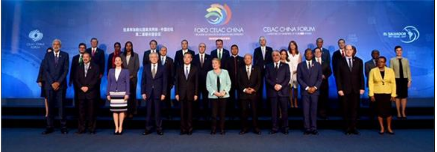
Group Photograph of the delegates of the Second Meeting of Ministers of Foreign Affairs of the CELAC-China Forum