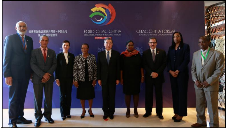
Senator the Honourable Dennis Moses, Minister of Foreign and CARICOM Affairs of the Republic of Trinidad and Tobago, His Excellency Wang Yi, Minister of Foreign Affairs of the People's Republic of China and other Ministers of Foreign Affairs of Caribbean States at the Meeting held between the Minister of Foreign Affairs of the People's Republic of China and Ministers of Foreign Affairs of Caribbean States at the CELAC-China Forum on 21st January, 2018.