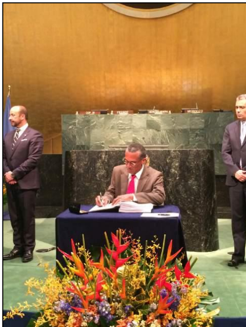
Senator the Honourable Dennis Moses, Minister of Foreign and CARICOM Affairs signs the Paris Climate Change Agreement on behalf of Trinidad and Tobago

Ministry of Foreign and CARICOM Affairs – 25 th April, 2015