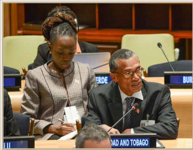
Senator the Honourable Dennis Moses, Minister of Foreign and CARICOM Affairs at the Global Leaders' Meeting on Gender Equality and Women's Empowerment at United Nations Headquarters in New York

Senator the Honourable Dennis Moses, Minister of Foreign and CARICOM Affairs, emphasised to the Summit of World Leaders that Trinidad and Tobago's implementation of the 2030 sustainable development agenda will be guided by its own national sustainable development strategy, which seeks to implement the sustainable development goals through twelve strategic priority areas over the period 2015 – 2025. Minister Moses delivered the statement at the United Nations Summit for the Adoption of the Post-2015 Development Agenda which was convened from 23rd to 27th September, 2015 in New York.