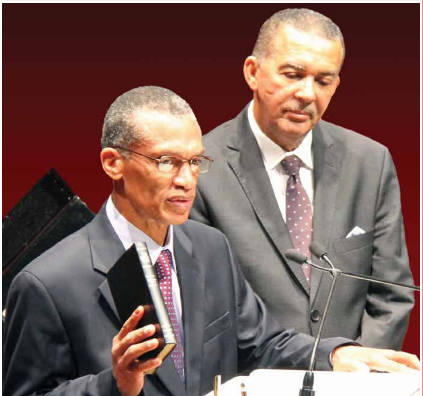
Senator the Honourable Dennis Moses, Minister of Foreign and CARICOM Affairs being sworn in by His Excellency Anthony Thomas Aquinas Carmona, O.R.T.T., S.C., President of the Republic of Trinidad and Tobago