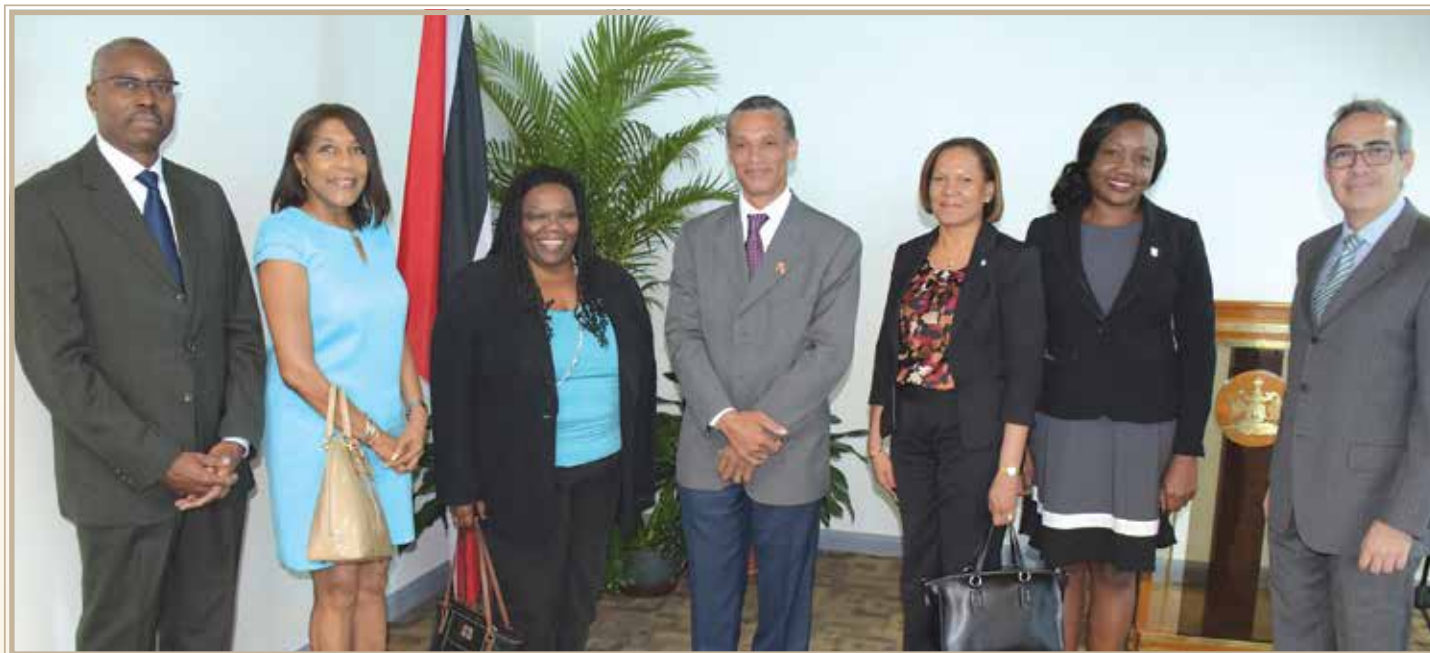
Senator the Honourable Dennis Moses, Minister of Foreign and CARICOM Affairs with representatives of the United Nations Agencies resident in Trinidad and Tobago

Senator the Honourable Dennis Moses, Minister of Foreign and CARICOM Affairs, informed members of the Diplomatic Corps and Heads of International Organisations that, “Trinidad and Tobago remains engaged and committed to making its contribution to regional, hemispheric and global affairs and to working with all its partners towards the future we want.” Minister Moses delivered the brief remarks on Monday 21st September, 2015 during a meeting at the headquarters of the Ministry of Foreign and CARICOM Affairs.