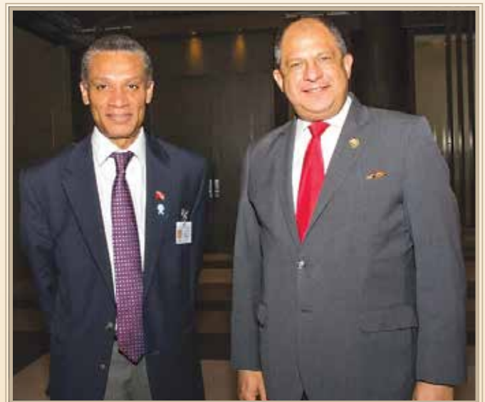
His Excellency Luis Guillermo Solís Rivera, President of Costa Rica with Senator the Honourable Dennis Moses, Minister of Foreign and CARICOM Affairs

In addition to the General Debate, Trinidad and Tobago participated in several high level meetings which included the annual Meeting of Foreign Ministers of the Community of Latin America and Caribbean States; the meeting of the Alliance of Small Island States; the Foreign Ministers of the Group of 77 and China; and the annual Meeting of Commonwealth Foreign Affairs Ministers.