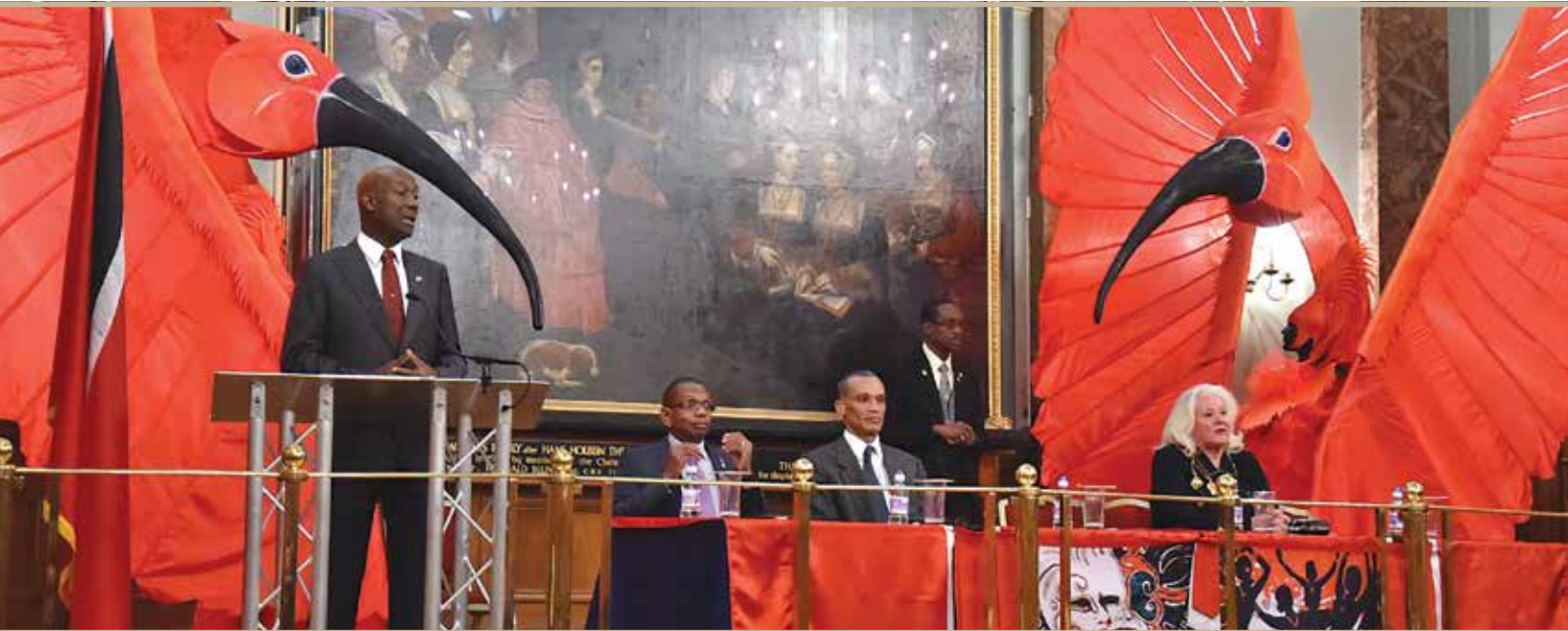
Prime Minister Dr. the Honourable Keith Rowley, Tedwin Herbert, Acting High Commissioner for the Republic of Trinidad and Tobago, London; Senator the Honourable Dennis Moses, Minister of Foreign and CARICOM Affairs and Councillor Julie Mills, Deputy Mayor of the Royal Borough of Kensington and Chelsea, London

D r. the Honourable Keith Rowley, Prime Minister of the Republic of Trinidad and Tobago spoke openly to the Diaspora on government's commitment to deal with issues of accountability, transparency in Public Office as well as economic and social challenges. The discussion took place on Monday 30th November, 2015 at Chelsea Old Town Hall, London during the Prime Minister's inaugural visit to the United Kingdom on his return journey from the recently concluded Commonwealth Heads of Government Meeting, which was held in Malta from 27th – 29th November, 2015.