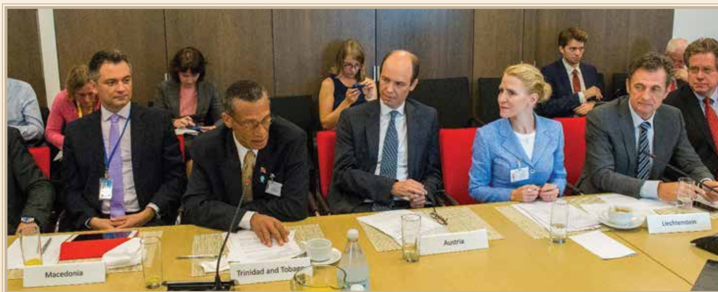
Senator the Honourable Dennis Moses, Minister of Foreign and CARICOM Affairs (2nd from left) participates in a Ministerial Breakfast Meeting at the Permanent Mission of Liechtenstein to the United Nations. (This annual meeting brought together individuals who hold political-level positions in their countries and are strongly committed to the cause of international criminal justice, in particular to the International Criminal Court)

an integrated and resilient ‘whole-of-Government’ approach to national security, and to contribute to the attainment of sustainable development in line with the Government’s strategic vision for Developed Country status by 2030.