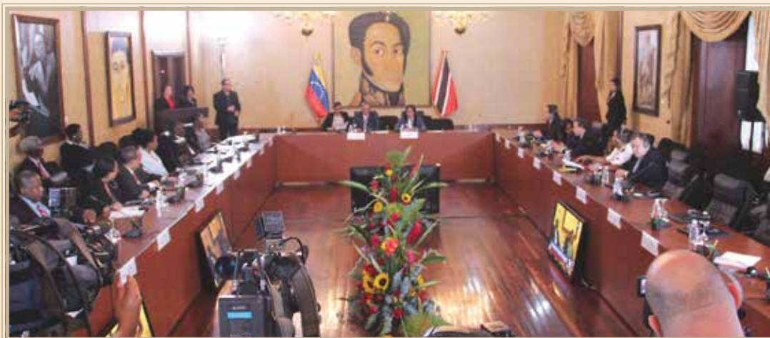
Working group session between Senator the Honourable Dennis Moses, Minister of Foreign and CARICOM Affairs of the Republic of Trinidad and Tobago and Her Excellency Delcy Rodriguez, Minister of People's Power for Foreign Affairs of the Bolivarian Republic of Venezuela in Caracas.