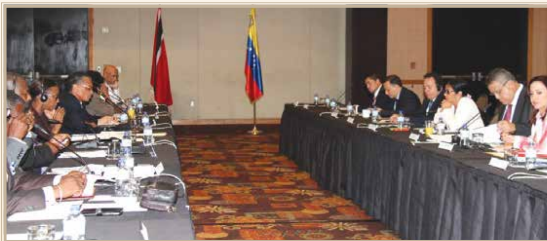
Senator the Honourable Dennis Moses, Minister of Foreign and CARICOM Affairs co-chairs a High-Level bilateral meeting with the Bolivarian Republic of Venezuela in Port of Spain.

Both sides agreed to the establishment, in the short term, of a structured mechanism to operationalise the decisions emanating from the high-level dialogue. The discussions laid the foundation for Trinidad and Tobago's participation in the bilateral High Level Consultative Mechanism held in Venezuela on 26th October, 2015. The high-level encounter resulted in a Joint Declaration embodying agreements reached for advancing collaboration in strategic areas of mutual benefit which include energy, trade, security and culture with time-bound undertakings.