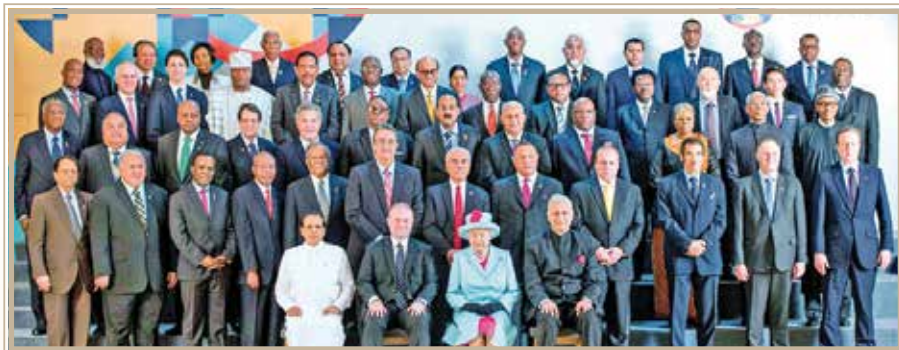
Heads of Government and representatives at the Commonwealth Heads of Government Meeting 2015

on the national agenda. Consequently, the Prime Minister's active participation in the informal dialogue on this issue at the CHOGM underscores the extent of the Government's commitment to promoting efficiency, fairness, transparency and honesty in the conduct of Government business across all sectors of the society, including the state enterprise sector. This is geared towards creating a cost-effective, competitive business environment and a just and stable society respectful of the rights of all citizens to equal and unbiased treatment.